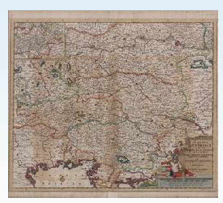
National & University Library of Slovenia